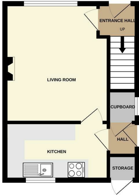
GROUND FLOOR 308 sq.ft. (28.6 sq.m.) approx.